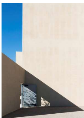
Tree and Shadow

Based in Santa Fe, New Mexico, United States, she has exhibited her photographs in the U.S. and internationally, including Santa Fe, New York, Brooklyn, Los Angeles, London, Berlin and Barcelona