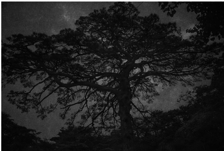
Loto Nero VII

The exhibition consists of six prints in gravure grain made by the art master Fanny Boucher (Atelier Hélio'g). The rediscovery of this original photographic technique gives Loto Nero a deep aesthetic where blacks are magically highlighted in different degrees, very vivid and resonant, to overcome the modest and adulterated tones that create uniformity and flatness. In Loto Nero, tormented conifers dance; they respond to the erratic movements of the mist with the same grace that one feels in front of classical paintings. But, if these images look like paintings, it is, in a certain sense, to better be photographs: it is for Costanza Gastaldi to cultivate, in each of her series, an ambiguity that undermines the "purity" genres to capture the interpretive and fictional power of photography without negating its specificity.