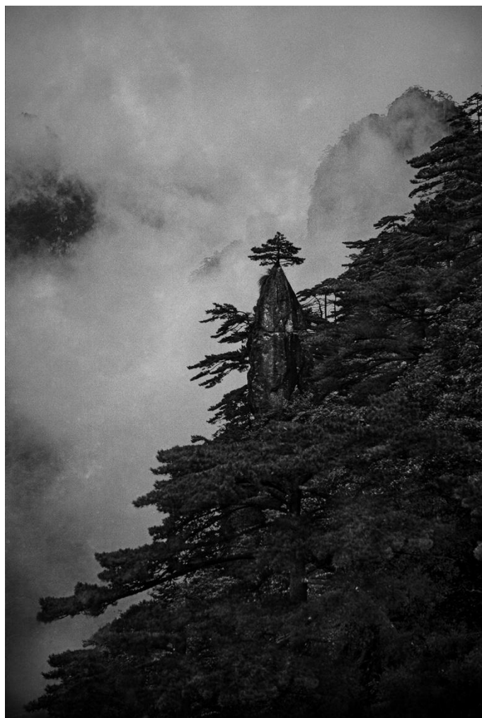
Loto Nero II©Costanza Gastaldi

Exhibition November 5 to December 14 teen 2019 Opening Tuesday November 5 from 4 to 9 pm