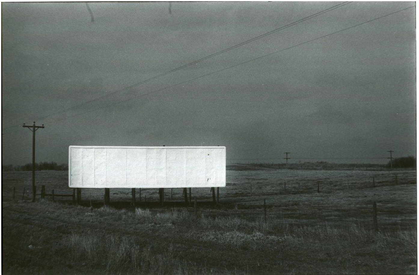
Billboard, USA, 1976

At the age of 16, Erich Hartmann fled Nazi Germany with his parents and immigrated to the United States. He first worked in textile factories and then enlisted in the American army where he served as a translator at the military trials shortly after the end of the war. After his service, Hartmann decided to become a photographer, beginning his career as a studio assistant and then going on to shoot portrait photography. In 1948, he entered the New School for Social Research. His meeting with Robert Capa in New York in 1952 was decisive as it led to Hartmann joining Magnum Photos. He became especially close to Inge Morath and Ernst Haas, and for his entire life he