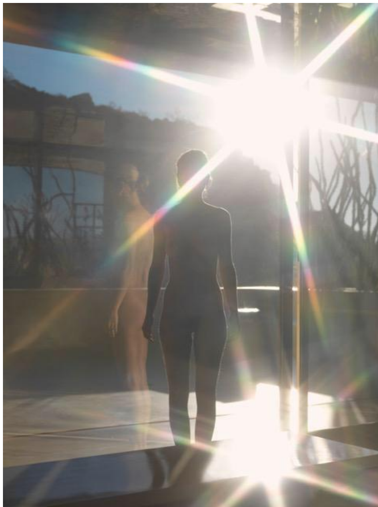
AD 7394, 2014, from "She disappeared in complete silence" series, chromogenic print

Tuesday to Saturday : 11am to 1 pm et 2h30 pm to 7pm